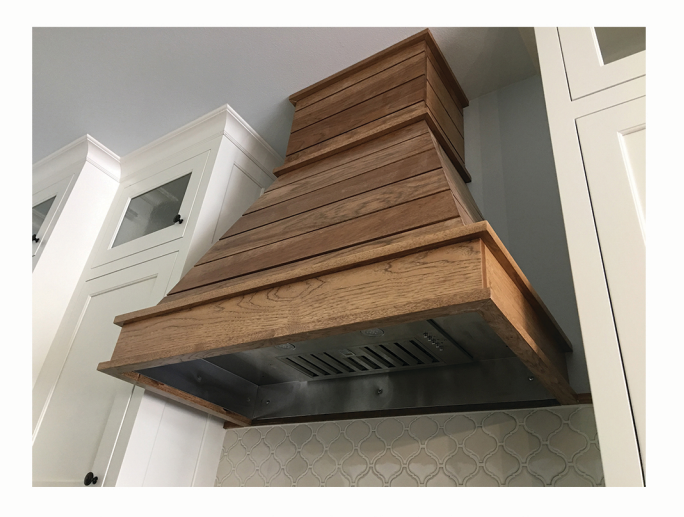
Components and Services for Cabinets, Closets, Display and Store Fixtures, Furniture, Home Building, Interior Millwork, Remodeling, and more.